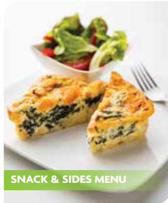
SNACK & SIDES MENU