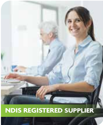
NDIS REGISTERED SUPPLIER