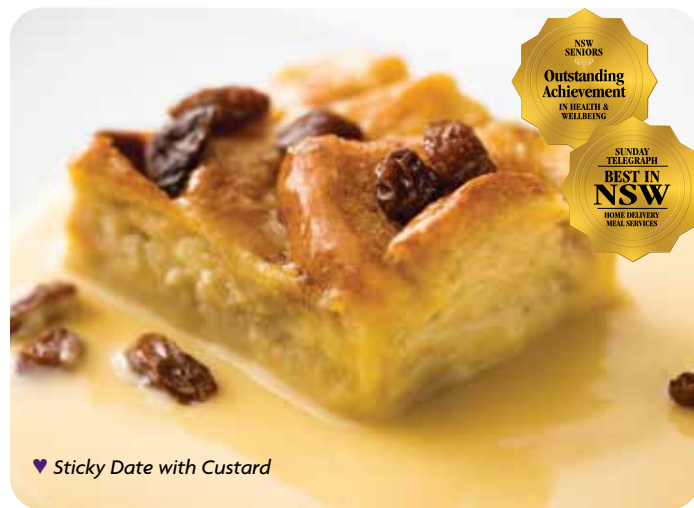
♥ Sticky Date with Custard