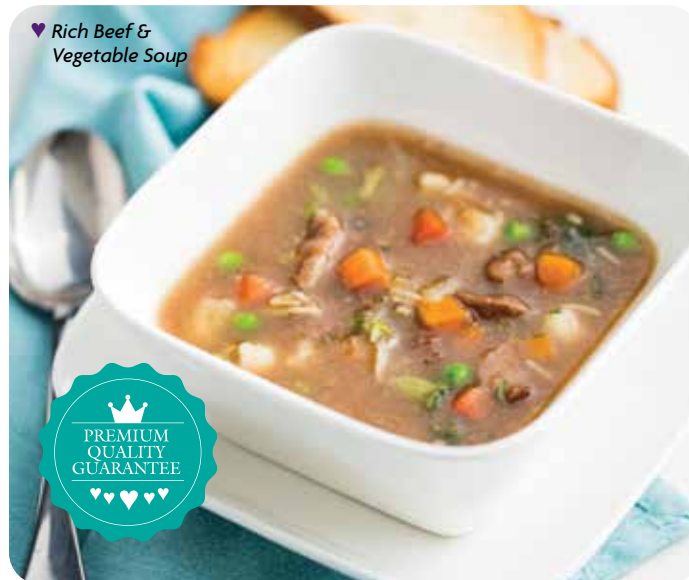
♥ Rich Beef & Vegetable Soup

Hearty beef, vegetable and pasta pieces in a tasty broth.