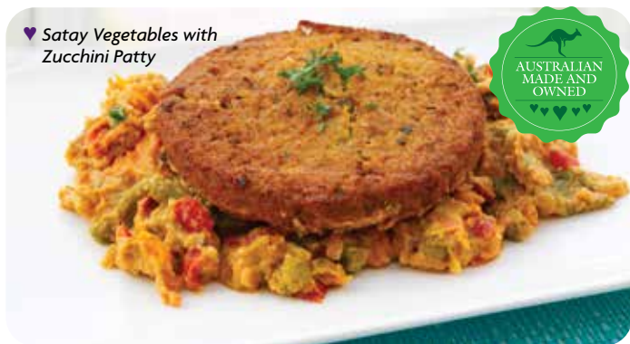
♥ Satay Vegetables with Zucchini Patty